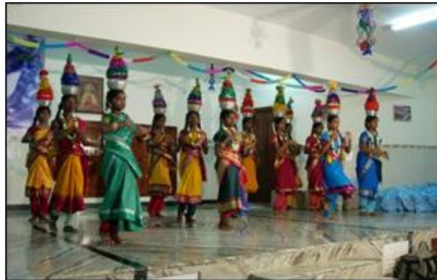
Children dancing for guests at the inauguration of the orphanage