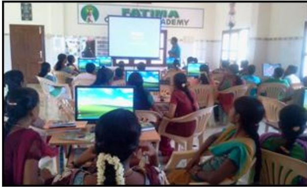
Fatima Computer Academy, in the orphanage